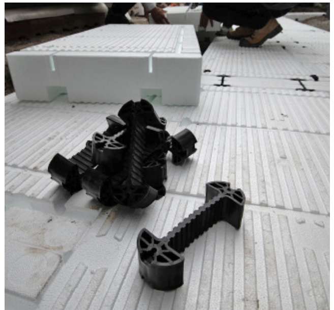
U-Core Connectors to lock units together

REDUCE YOUR COMPANY'S CARBON FOOTPRINT; estimated five to seven times the number of gravel