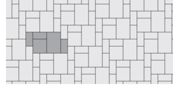
LP TREO FIXED RANDOM D PDF