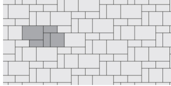
LP TREO FIXED RANDOM E PDF