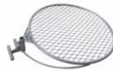
24" SWING AWAY GRILL (works with Sunset Round only)