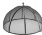
ROUND FIRE SCREEN (works with Sunset Round only)

The following accessories are available for any fire pit kit. Contact your local Territory Manager for details.