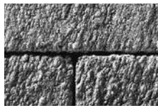
IL CAMPO FINISH