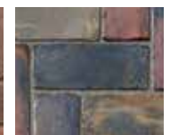
HERITAGE 2 COLOR BLEND Sold Separately/ Blended on Site