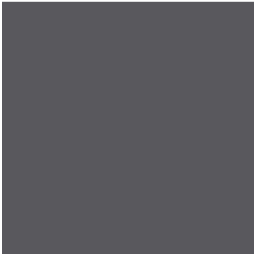
EDGE ZERO EDGE DETAIL