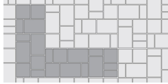
LP TREOSMOOTH FIXED RANDOM S PDF