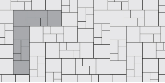
LP THORNBURY FIXED RANDOM B PDF