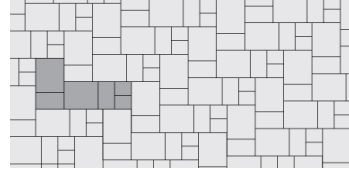
LP THORNBURY FIXED RANDOM C PDF