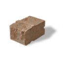
STANDARD 200mm x 150mm x 300mm 7 7/8" x 5 7/8" x 11 7/8"