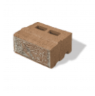
XL WALL 400mm x 150mm x 300mm 15 3/4" x 5 7/8" x 11 7/8"