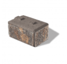
CORNER DOUBLE UNIT 200mm x 150mm x 300mm 7 7/8" x 5 7/8" x 11 7/8"