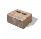
XL WALL 400mm x 150mm x 300mm 15 3/4" x 5 7/8" x 11 7/8"