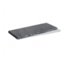
COPING W/ DL ROCK FACE 355mm x 1,200mm x 50mm 14" x 47 1/4" x 2"