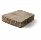
COPING TAPERED 320mm x 75mm x 300mm 12 5/8" x 3" x 11 7/8"