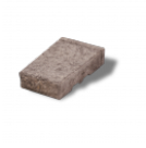
WEDGE CAP 248mm x 86mm x 330mm 9 7/8" x 3 1/2" x 13"