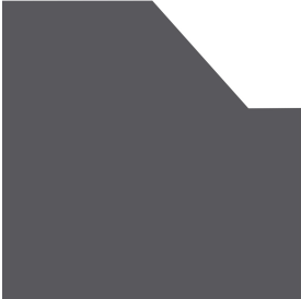
EDGE CHAMFERED EDGE DETAIL