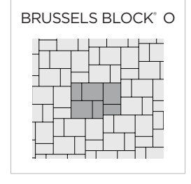
BRUSSELS O 33% Half Stone, 67% Standard